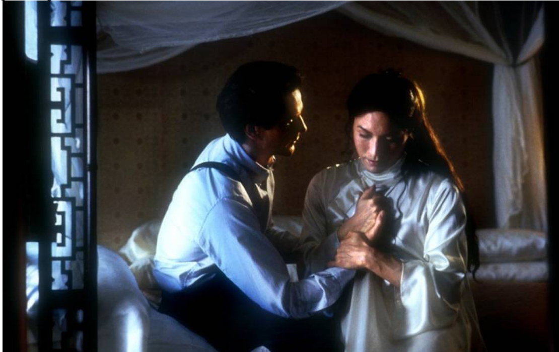
Figure 1: Movie Stills: Huang Zhelun's superb acting

of postcolonial cultural theory is to completely change the relationship between "subject/other" in colonial culture, which is a discourse of a vulnerable group. Feminist criticism emerged in the middle of the 20th century, prompting it to produce a feminist movement in the early period. As a vulnerable group in the male subject environment, women have been trying to subvert the mainstream culture in the feminist movement, changing their marginal status and mastering their own right to speak [2] .